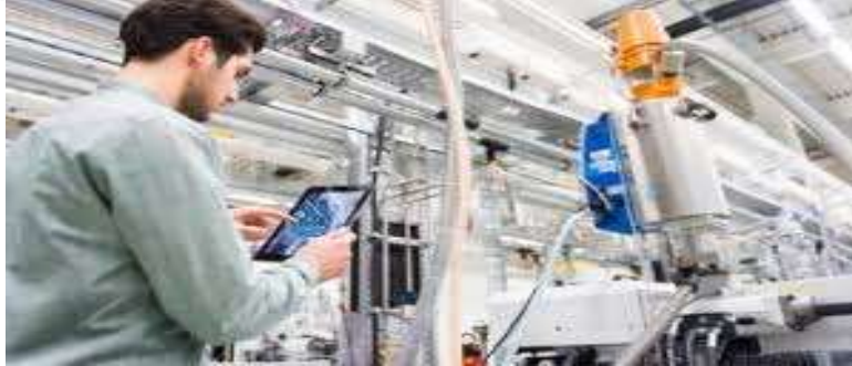
Figure 2 : Example Industrial interface The Internet Of thing (IIoT) [17]