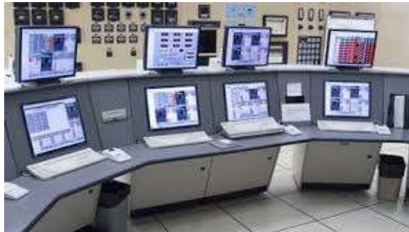
Figure 3: Example of a control room [18]

In industry (as manufacturing the automotive sector and continues as the cement industry) All installations and industrial processes are related are supervised by the means of a DCS (Distributed Control System). This type of system has a human-machine interface through a network of digital communication (local network industrial) and which is equipped with a network architecture that can be specific to each publisher of these systems, a set of measuring and control instruments allowing to make in real time the acquisition of the parameters of the marches of facilities such as the flow, pressure, temperature. The history of all parameters of walking on a factory are available for a long period of up to six months depending on the editor of these DCS and this to have a mainly traceability of the analog inputs related to ongoing settings, logical entries for events as well as the logical outputs and analog for the control of the equipment and the instructions of the control loops, this clearly means that at the end of a certain period. It is certain to have a massive acquisition of data from the various sensors and production equipment as well as the need to have a large storage capacity of the historic.