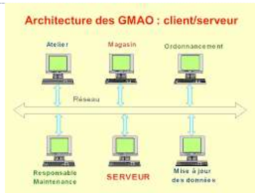
Figure 6: Example CMMS Architecture