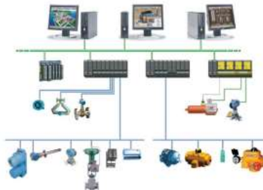
Figure 4: Example of a DCS [19]